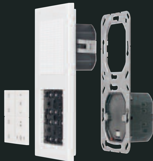
Simple installation – thanks to the prewired and preassembled components

The operation of the JUNG radio is carried out simply and conveniently via the four large push-buttons which are assigned the functions "ON/OFF, sleep mode and station scan", "Volume", "Memory 1 and 2" and "Memory 3 and 4". The additional status LEDs in blue and red further optimise the handling of the device.